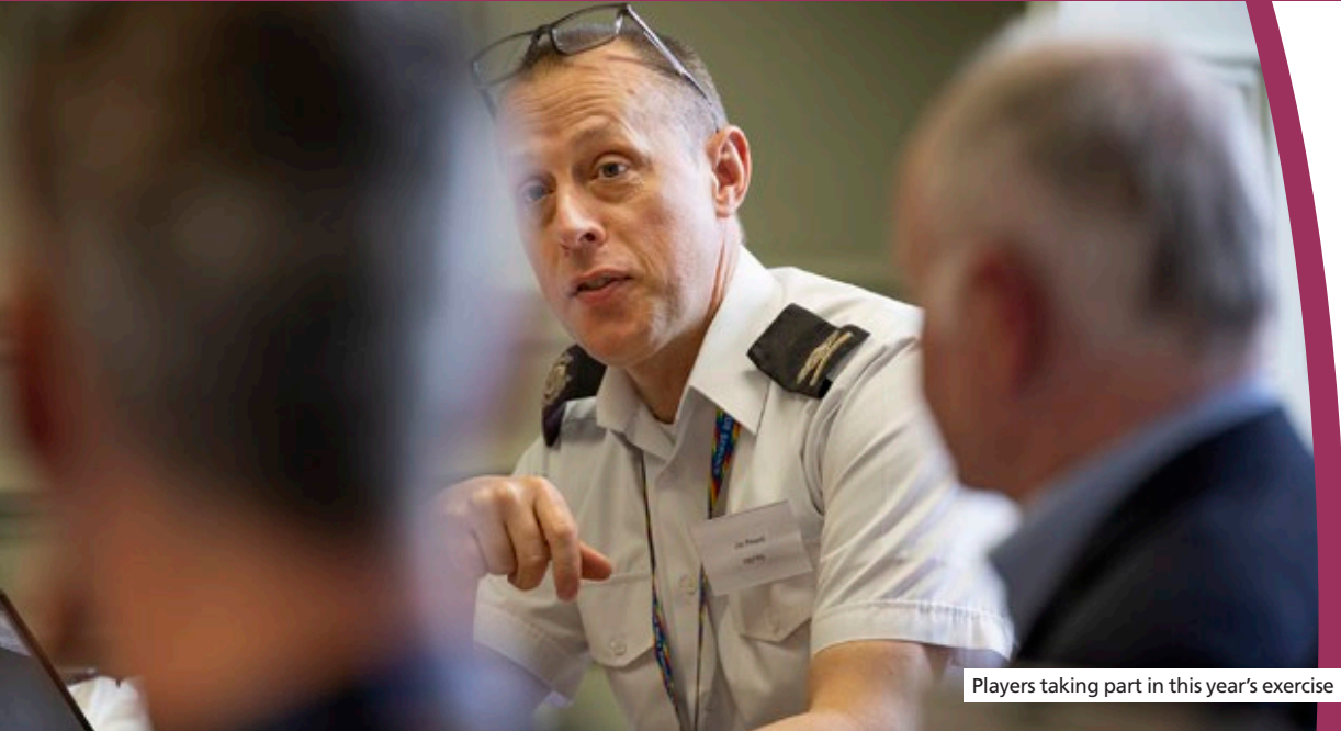
Players taking part in this year's exercise