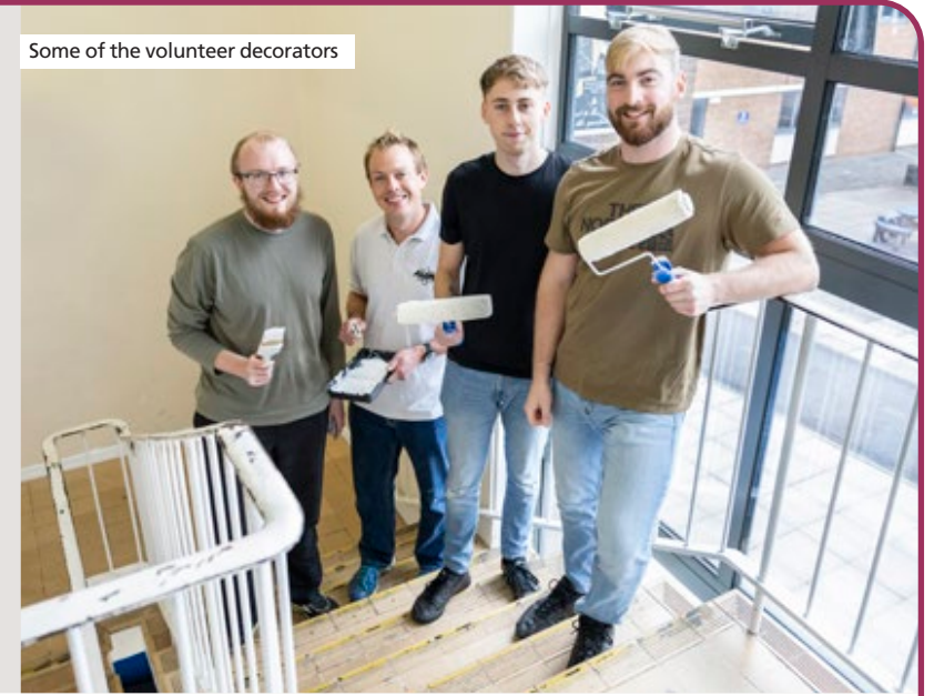
Some of the volunteer decorators