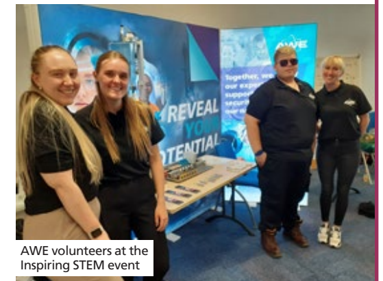
AWE volunteers at the Inspiring STEM event

Assisting on the day were 18 STEM Ambassadors and apprentices from AWE, who helped organise events for the 250 young attendees and inspire them about all things STEM. Prizes were given to schools who won our Glovebox and Escape Room Challenges.