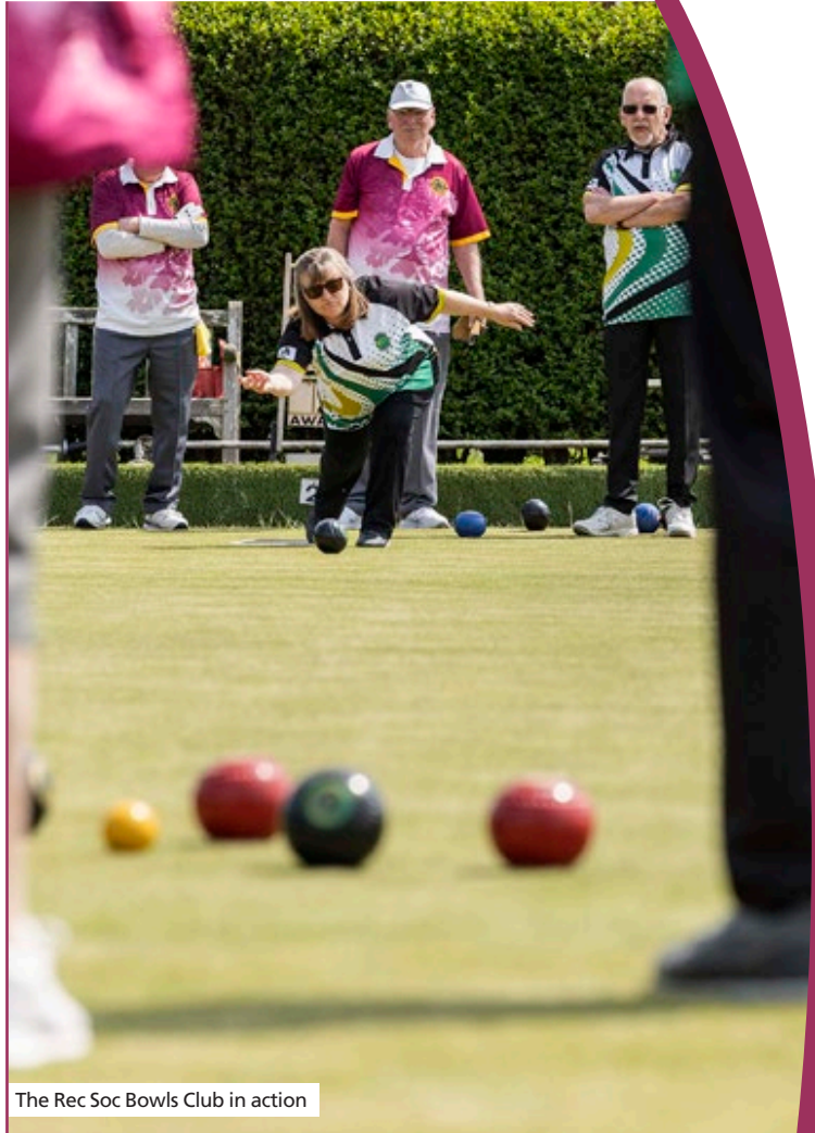
The Rec Soc Bowls Club in action