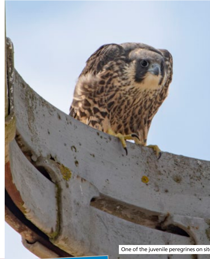
One of the juvenile peregrines on site