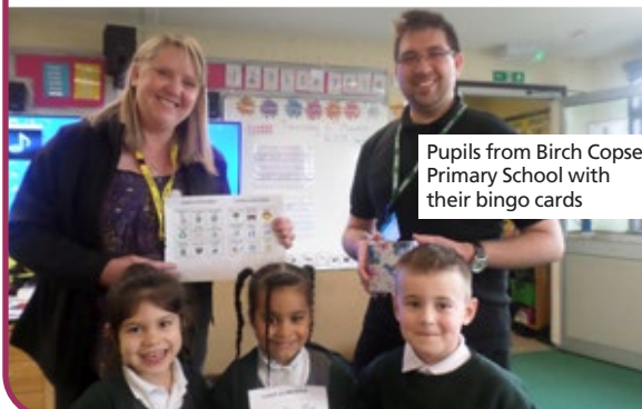
Pupils from Birch Copse Primary School with their bingo cards