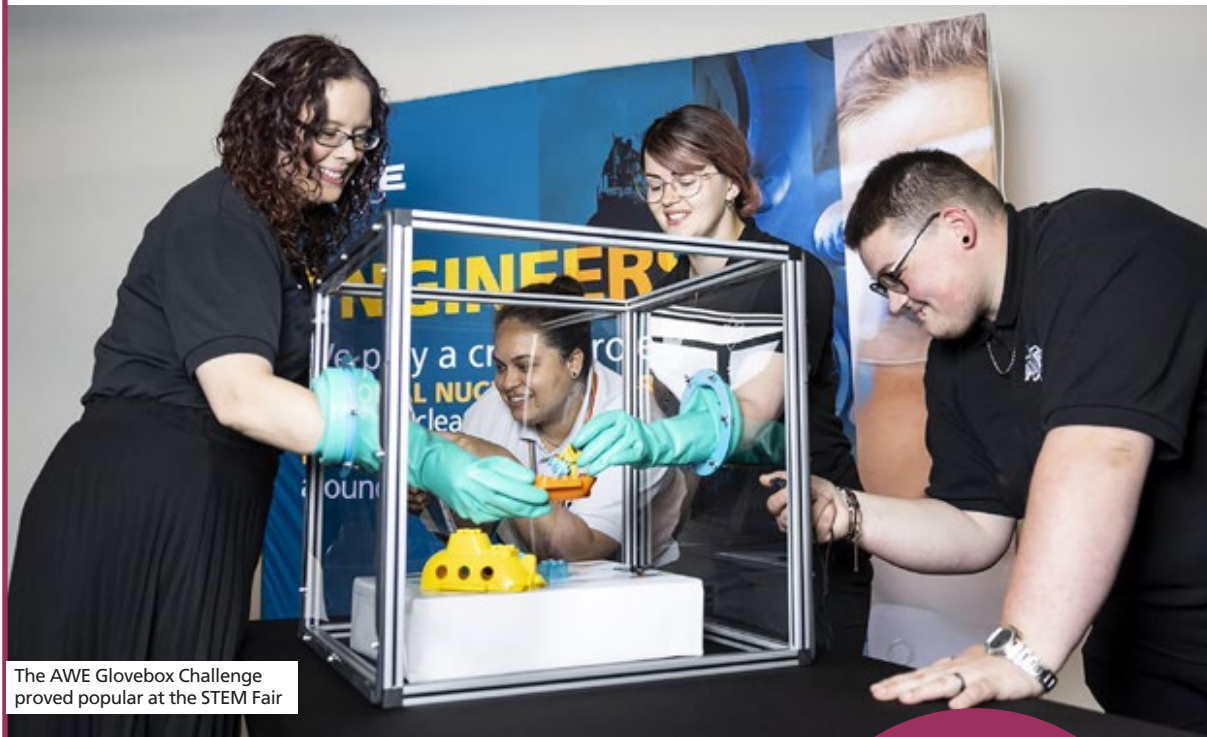
The AWE Glovebox Challenge proved popular at the STEM Fair