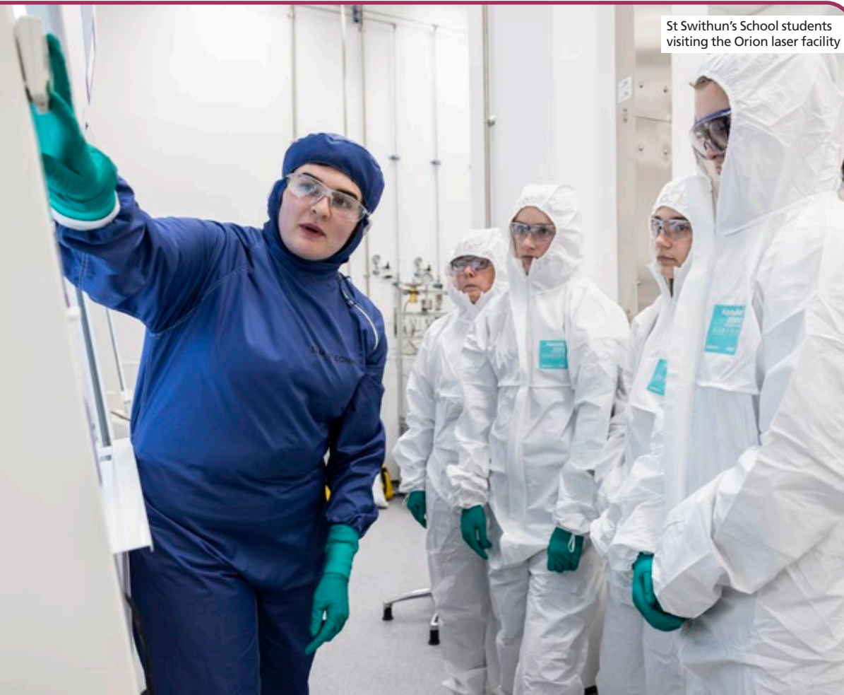
St Swithun's School students visiting the Orion laser facility

The events spanned a wide number of year groups with sessions entitled 'People Like Me' and 'Guess My Job' proving very popular with the students. The in-school events were delivered in partnership with EBP West Berkshire.