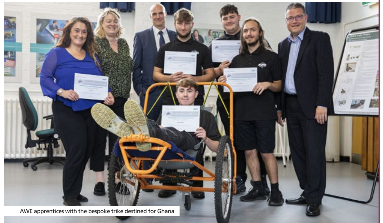
AWE apprentices with the bespoke trike destined for Ghana