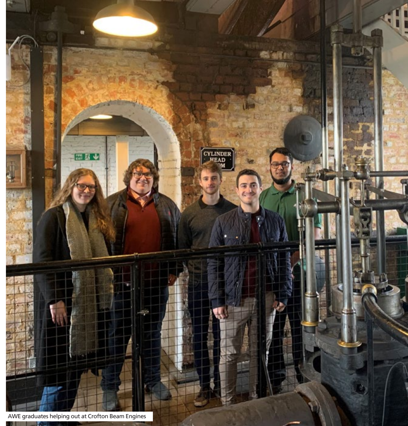
AWE graduates helping out at Crofton Beam Engines