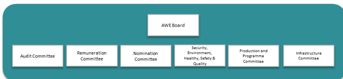
Figure 3: Key Governance Forums

AWE will have a Board which will operate in line with good standards of corporate governance and in particular the Financial Reporting Council’s UK Corporate Governance Code 7 . Figure 3 sets out the Key Governance Forums, including composition, of AWE, and Table 2 sets out the key responsibilities for each role. Further detail on roles can be found at Annex A and full details of sub-committees can be found at Annex B.