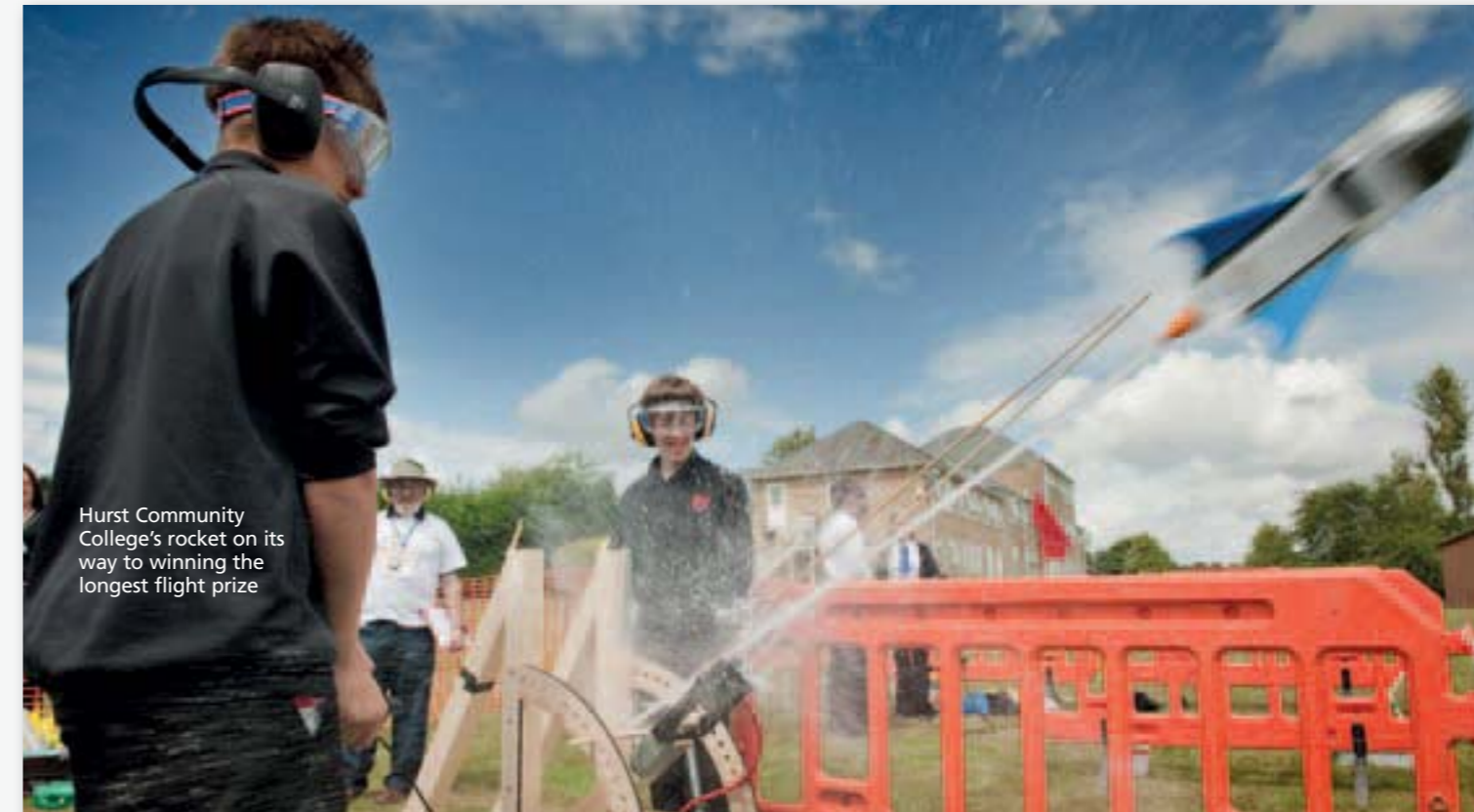
Hurst Community College's rocket on its way to winning the longest flight prize

clean in all our operations." ● To add to the company's success, AWE's construction management department was awarded a RoSPA Gold Medal for five consecutive Gold Awards.