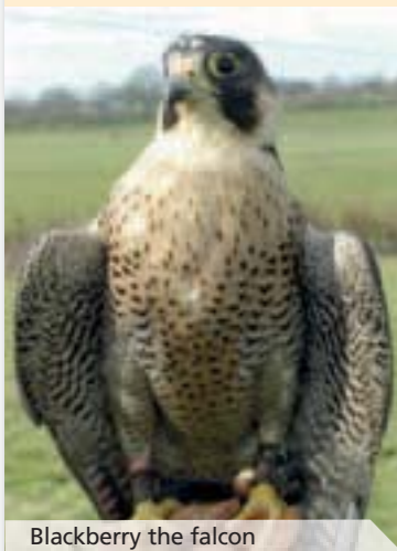
Blackberry the falcon

"Thank you to everyone at AWE who helped to bring her home safely."