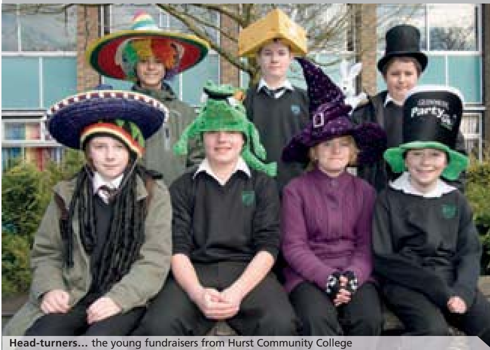
Head-turners... the young fundraisers from Hurst Community College