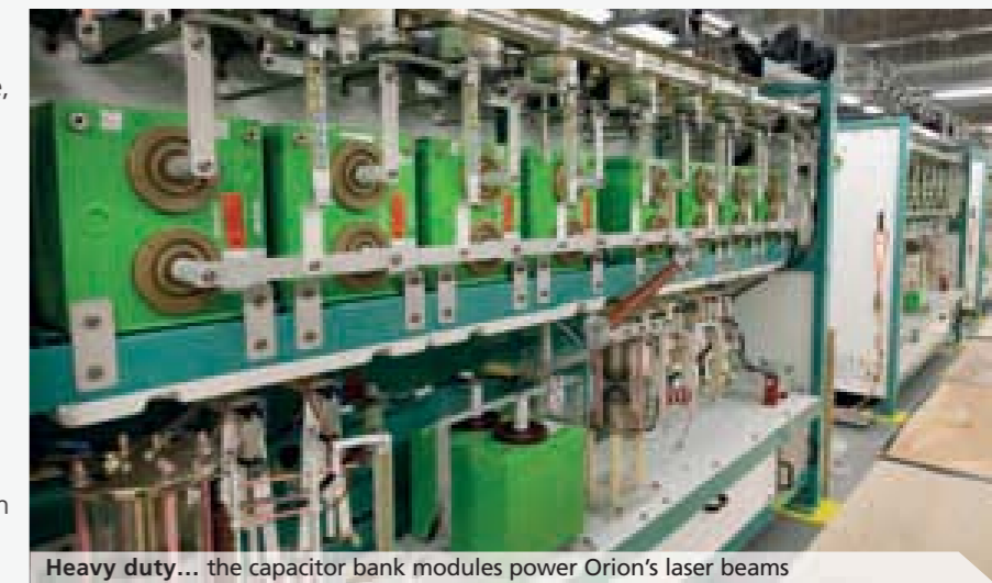
Heavy duty... the capacitor bank modules power Orion's laser beams