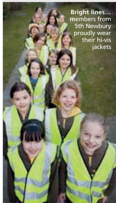
Bright lines... members from 5th Newbury proudly wear their hi-vis jackets