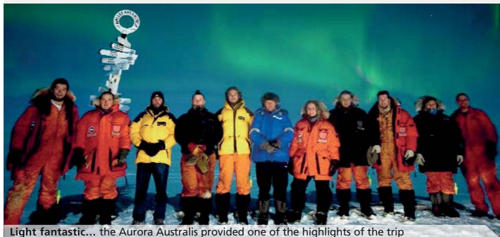
Light fantastic... the Aurora Australis provided one of the highlights of the trip