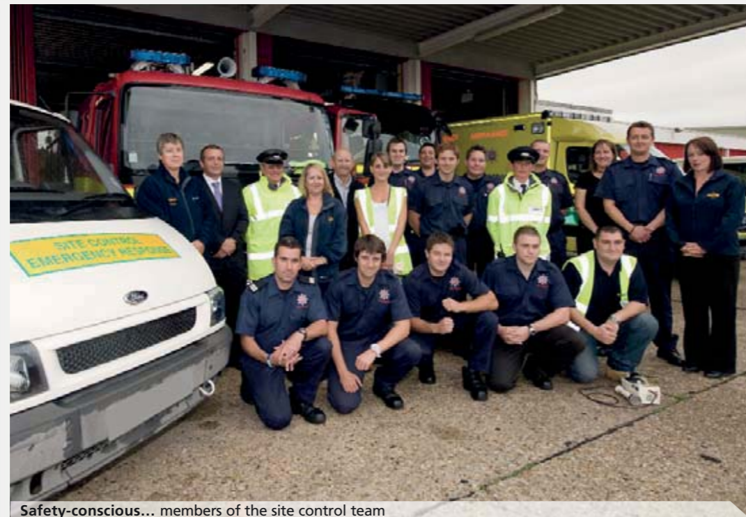
Safety-conscious... members of the site control team

Other schools that took part were Kennet School, Thatcham; St Bartholomew's School, Newbury; Mary Hare School, Newbury and Denefield School, Reading.